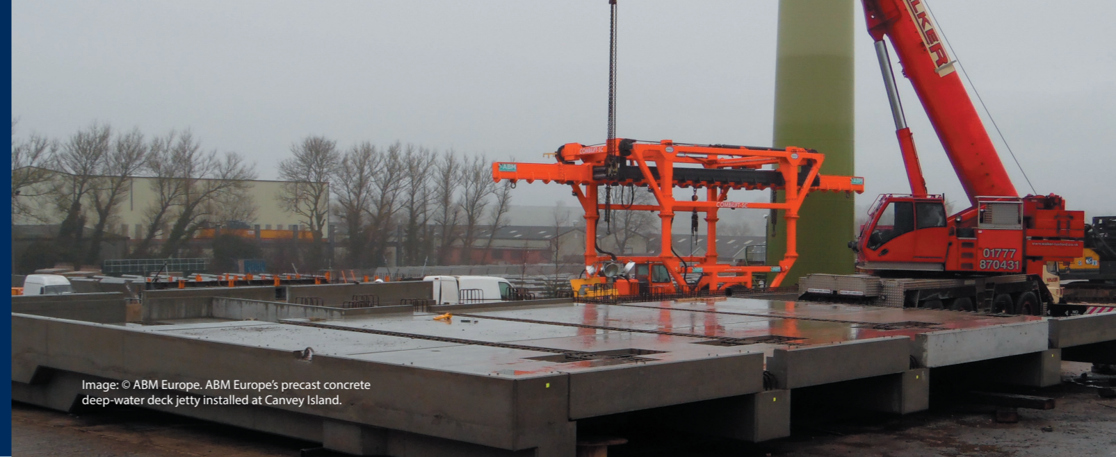
ABM Europe's precast concrete deep-water deck jetty installed at Canvey Island.

With the rise of the Net Zero carbon agenda , the precast sector is employing a wide range of measures to enable a Net Zero future for construction.